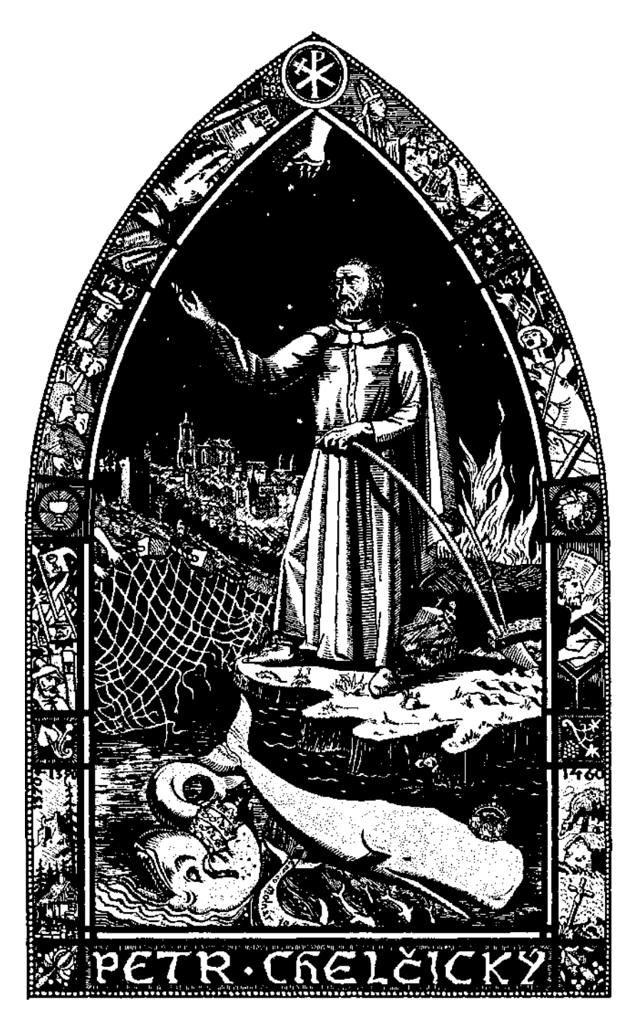
Peter Chelčický – A Symbolical Pen Drawing