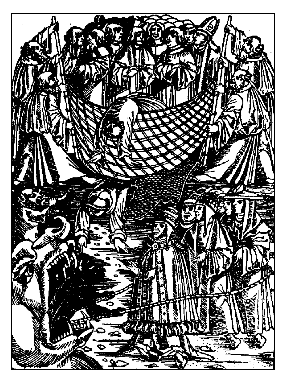
Frontispiece Illustration of the 1521 Edition of The Net of Faith Printed in the Monastery of Vilémov

(The net is held by four apostles and in the net are the righteous Christians. One sinner is falling overboard and another is escaping through a big hole in the torn net. Below, protruding from the open jaw of an infernal leviathan, the devil is roping in the pope, the emperor, the learned doctors, and other sinners.)